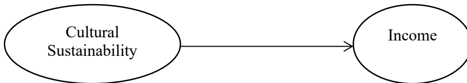
Figure 2: Cultural sustainability on income author, 2021 [source]

businesses involved. Research on culture related to income is mostly carried out by researchers in Indonesia. Research related to income is like the art establishment in America (Arikan et al., 2019). In China, research is only done by studying the factors that influence the socioeconomics of cultural participation. (Courty & Zhang, 2018). Therefore, we recommend the research concept to be developed in the next research, namely: