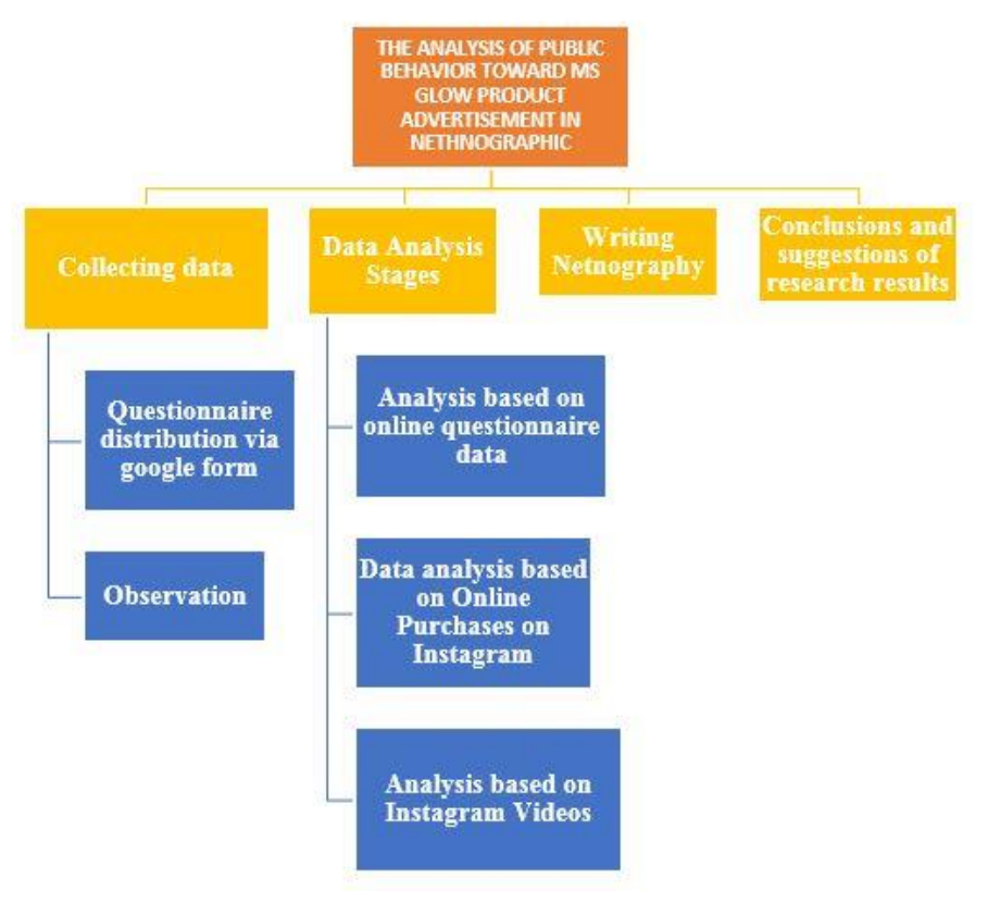
Figure 2: Analysis Flow