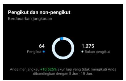
Figure 3(b): Insights after no ad video

Based on Figures 3(a) and (b) it can be seen that there is a significant increase in insight. Meanwhile, based on the amount like, comments, dan views obtained e management rated by 3.9%. Acquisition score e management rate based on Formula 1 below.