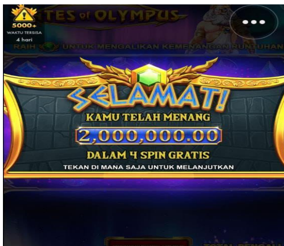
Picture 3: Online Gambling Winning Page 1

which promises to make them feel challenged and curious, so they try to play the online slot game, apart from that there is also an offer offered by the admin. If they win in one game, they will get a free Brilliant that they can use to play in the next game. One of the causes from a social perspective that makes playing online slot games is the development of technology and increasingly easier accessibility. Z Generation grew up in an era of highly sophisticated and well-connected technology (Shinta, personal communication, September 27, 2023).