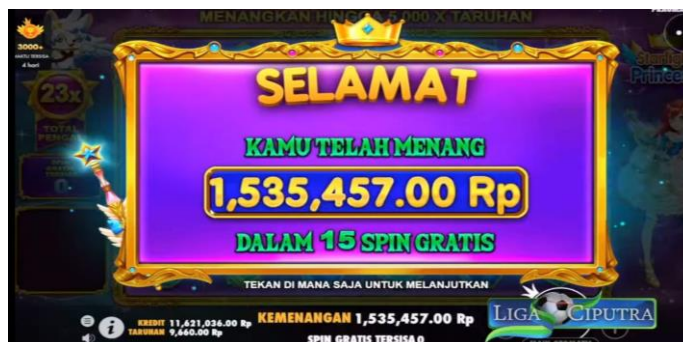
Picture 4: Online Gambling Winning Page 1

The ability to access these games via mobile devices and fast internet connections has made them more accessible than traditional gambling in brick-and-mortar casinos. By simply swiping their phone screen, they can enter the world of online gambling without having to leave the house. This effect of technology and accessibility has made playing online slot games a very accessible form of entertainment for the Z Generation, who are active users of technology. Social media also plays a big role in popularizing online slot games among the Z Generation. This generation is very connected to social media platforms such as Instagram, YouTube, and TikTok, where they are exposed to various content related to online gambling. Live streaming videos or reviews of online gameplay, often posted by social media users, can influence Z Generation's perception and interest in these games. Most of them see their peers playing and share their experiences via social media, which can spark curiosity and interest in trying their luck in the game (Riko, personal communication, September 22, 2023). In this case, social media has become an important tool in the spread and popularity of online slot games among the Z Generation.