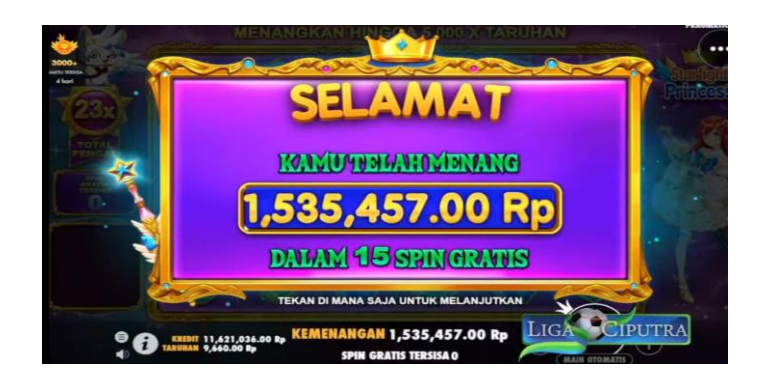
Picture 3: Online Gambling Winning Page 1