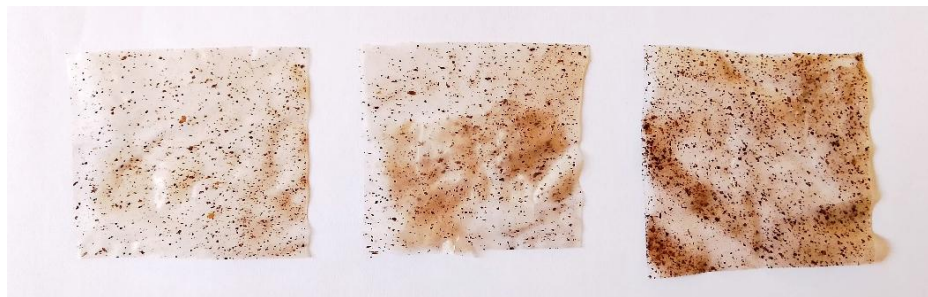
Figure 1. Visual appearance of cassava starch-based bioplastic films reinforced with varying concentrations of spent coffee grounds (SCG): (left) B1 with 10% wt, (center) B2 with 20% wt, and (right) B3 with 30% wt.

The visual appearance of the bioplastic films is significantly impacted by the concentration of SCG, as shown in Figure 1. The film's ability to retain high transparency and a smooth, homogeneous surface at 10% loading indicates excellent compatibility and uniform filler dispersion within the starch matrix. Higher opacity and a darker hue are the results of increasing the SCG content to 20%. At this stage, localized agglomeration and minor surface irregularities start to show, indicating that the matrix is starting to reach its limit for consistent filler integration. The film becomes primarily opaque and visually heterogeneous at the maximum loading of 30%. There is noticeable particle clustering, which results in structural discontinuities and a rougher texture.