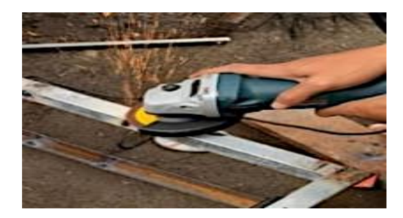
Figure 5. Smoothing process