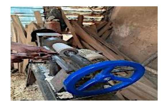
Figure 6. Turning process