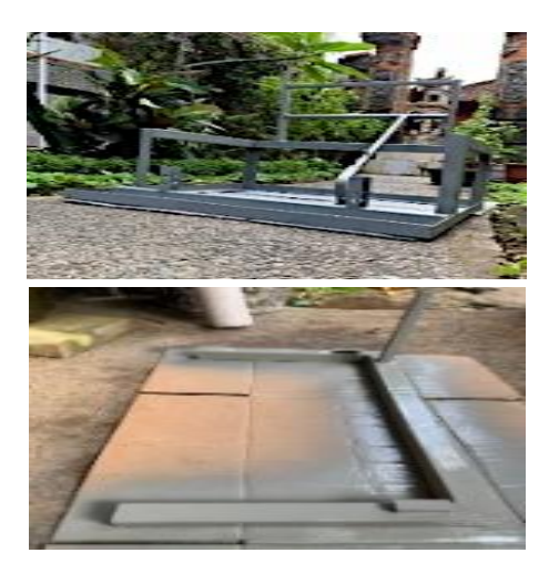
Figure 8 Primer