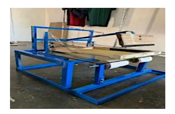
Figure 3. Multifunctional manual screen printing tool