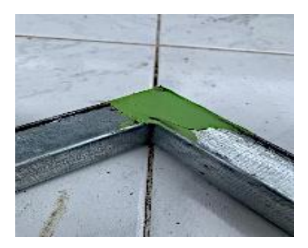
Figure 7 Putty process