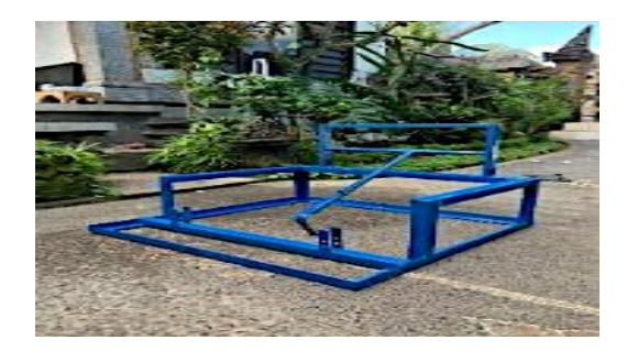
Figure 9 Blue color painting