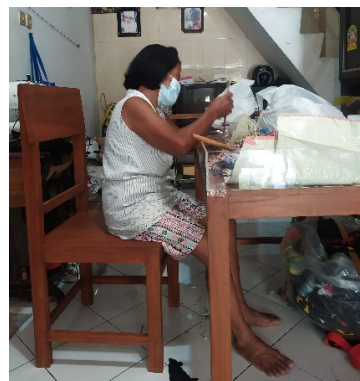
Gambar 3. Worker Posture Design conditions