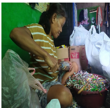
Gambar 2. Initial Condition Worker Posture

In the initial conditions, the ecobrick plastic compaction workers worked with non-ernomic work postures. The worker sits with his legs folded inward (bursila) and his right hand raised up to form a 45°C angle while pushing a stick of plastic material into the bottle. Kriri's hand holds the bottom of the bottle and attaches it to the left thigh. This condition is carried out repeatedly for a long time as shown in Figure 2. Before the design of the plastic compactor is done geometrically, the body posture while working looks unnaturally awkward. This work is done repeatedly, with a lot of strength and in quite a long time.