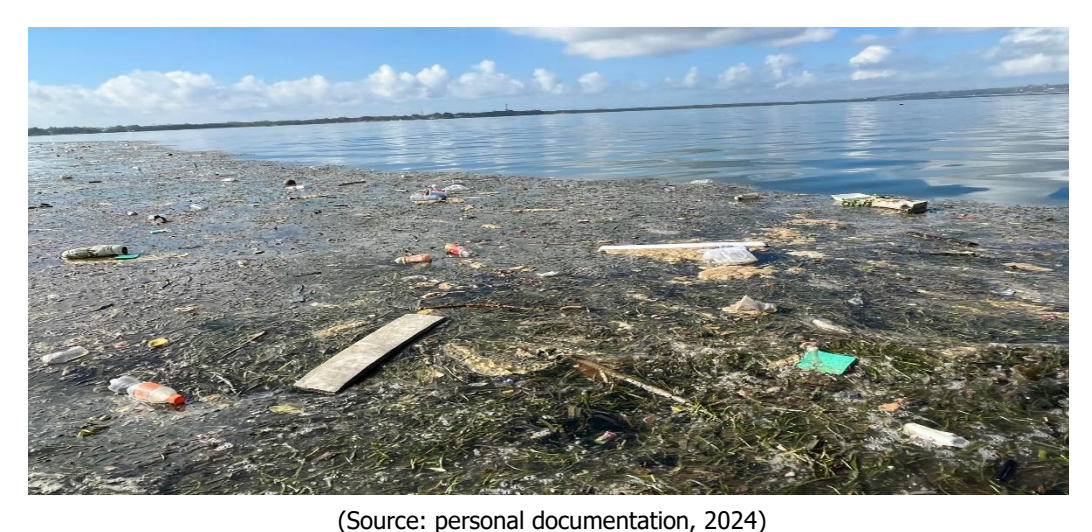
Figure 4. Marine pollution by trash at Nusa Dua Beach

Economic Challenges are unequal distribution of tourism economic benefits to local communities. Although tourism contributes significantly to Bali's economy, its economic benefits are often unevenly distributed to local communities. The economic gap between tourism and non-tourism areas are still quite high (Byczek, 2011); High dependence on the tourism sector, vulnerable to external shocks Bali is highly dependent on the tourism sector as the main source of regional income. This makes Bali's economy vulnerable to external shocks, such as natural disasters, disease outbreaks, or the global economic crisis (Prideaux et al., 2020) and unfair price competition among tourism businesses. The high competition in Bali's tourism industry sometimes encourages businesses to implement unhealthy pricing strategies, such as price wars or reduced service quality. This can harm the sustainability of tourism businesses (Chok et al., 2007).