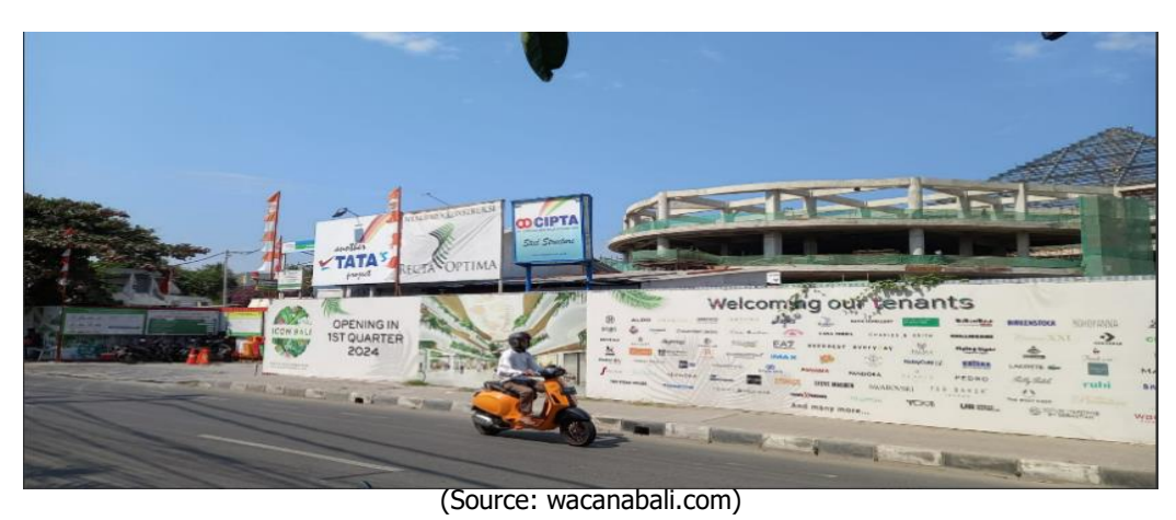
Figure 3. The construction of the largest mall in Bali

the decision-making processes. This can ultimately lead to disparities in social and economic conditions (Can et al., 2014) and possible confrontations between local communities and visitors concerning cultural conventions. Variances in cultural heritages between local communities and visitors may spark disagreements, particularly if visitors fail to acknowledge or comprehend the local cultural conventions, such as the dress code when accessing sacred sites (Howe, 2006).