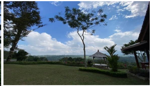
Figure 2. Pelaga tourism village in Badung Regency

Despite seeing some successful cases, the growth of green tourism in Bali is met with numerous challenges, particularly focusing on environmental issues. These challenges include environmental challenges, socio-cultural challenges, and economic challenges. Environmental Challenges are the deterioration of the environment as a result of tourism infrastructure that neglects eco-friendliness. The establishment of hotels, resorts, and other tourism amenities often overlooks crucial aspects of environmental sustainability, leading to the conversion of agricultural land or forests, water and air pollution, and disruption of local ecosystems. The construction of the largest mall in Bali can be seen in Figure 3; Inefficient waste management, particularly in tourist hotspots. The influx of tourists contributes to a surge in waste generation. Inadequate waste management, especially in tourist areas, can lead to environmental contamination and reduce the appeal of the destination. It can be seen in Figure 4; Endangerment of biodiversity due to land alterations. Converting land for tourism purposes puts local flora and fauna at risk. Certain endemic Balinese species like the Bali starling, are extinction threats due to the destruction of their natural habitats.