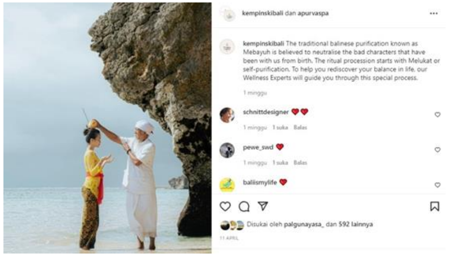
Figure 5. Local Culture & Traditions

The involvement of local traditions and cultures is shown in the regular program offered by the hotel through the department of spa, gym, and recreations. The activities are packaged by the Balinese rituals for example melukat at Pura Geger. The harvest result of the hydroponic contributes to decreasing the budget cost of food and beverages although still in a small number.