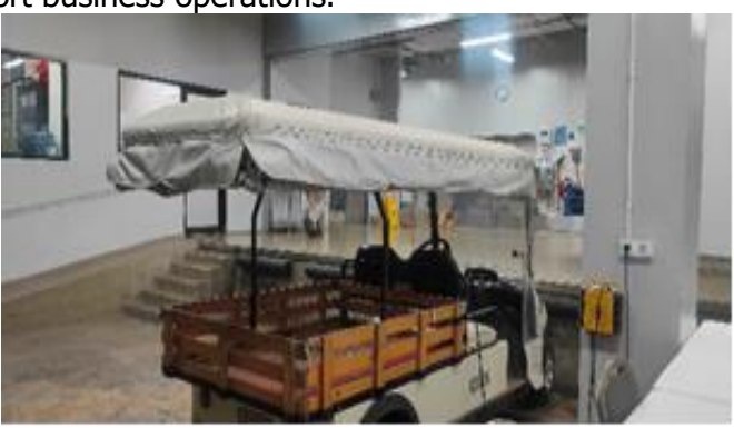
Figure 2. Buggy Charging Station

Greenhouse gas emission is often coming from energy, land use and forestry, and waste (Rahmadania, 2022). Energy consumption coming from fuel, electricity and gas. To compensate for the high purchase of fuel, the management used some of electricity vehicles. The Apurva Kempinski Bali has buggies and moggies that use electricity to support business operations.