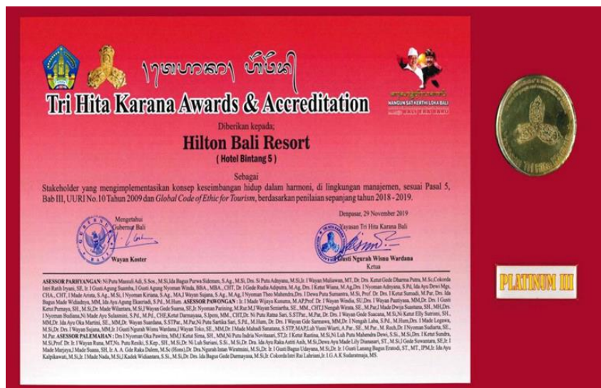
Figure 5. THK Awards & Accreditation

From before the implementation of THK and after its implementation, according to the hotel duty manager the changes that can be seen are very significant. After the implementation of THK, everything is more focused, so that other people can see the direction. This can be proven where Hilton Bali Resort has received an award from the implementation of THK in 2019.