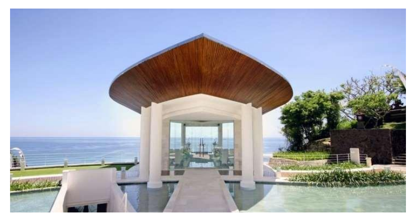
Figure 3. Wiwaha Chapel, a Place for Guests (Pawongan) to See Natural View (Palemahan)

be more friendly, welcoming and emit positive attitudes which of course can be felt by guests. This can be created because there is no burden for staff, there is nothing to worry about so that even before leaving for work the staff will feel excited and ready to carry out work.