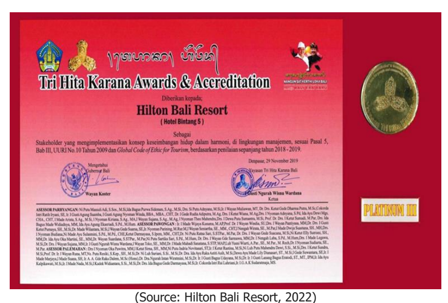
Figure 5 . THK Awards & Accreditation

From before the implementation of THK and after its implementation, according to the hotel duty manager the changes that can be seen are very significant. After the implementation of THK, everything is more focused, so that other people can saw the direction. This can be proven where Hilton Bali Resort has received an award from the implementation of THK in 2019.