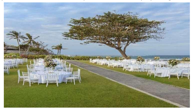
Figure 4 . Serenity Beach, a Place to See Natural View (Palemahan)

Regarding palemahan, the application of the palemahan concept in the front office at Hilton Bali Resort is by reducing the use of plastic which is replaced with more environmentally friendly materials, using glass cups to serve welcome drinks so that they can be refilled and reused. Increase awareness to protect the environment such as reducing paper use by using email to send the payment receipt or bills to guests, using recycled paper in the check-in or check-out process and other operational related needs which will also have an impact on cost savings or expenses, apart from it can also reduce waste in the front office. The lobby area is equipped with trash cans which are categorized into organic, non-organic, and plastic waste that makes it easier for companies to recycle waste, such as organic waste which is recycled into compost and used for maintaining hotel gardens. In the front office area at the Hilton Bali Resort there are several plants which of course are treated by regular watering. The hotel is located on a cliff and is surrounded by forest, so it is not uncommon for the front office area to be approached by monkeys, but staff or guests are prohibited from harming the monkey. When disturbed, monkeys are chased away by using sound or noise.