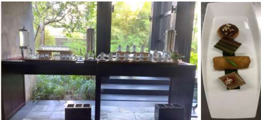
Figure 2. Application of Zero Waste for Meeting at The Apurva Kempinski Bali

By providing water and coffee station it is part of The Apurva Kempinski Bali to support zero waste on event, also by eliminating the waste of bottle water and one time used cup. For coffee break it is used banana leaf as the garnish to eliminate food waste.