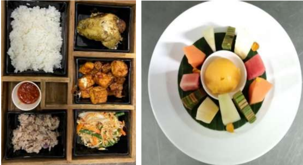
Figure 3. Application of Zero Waste for Lunch Meeting at The Apurva Kempinski Bali

groups; Economic planning in public policy (due consideration to tourism industry); Revamping the functions of Visit Britain (National Tourism Agency) to address performance and value; Securing investment initiatives from private and public sector; Create cutting edge marketing campaigns and solicit government support (Ramgulam et al., 2012).